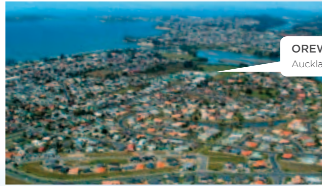
OREWA COLLEGE Auckland, NZ